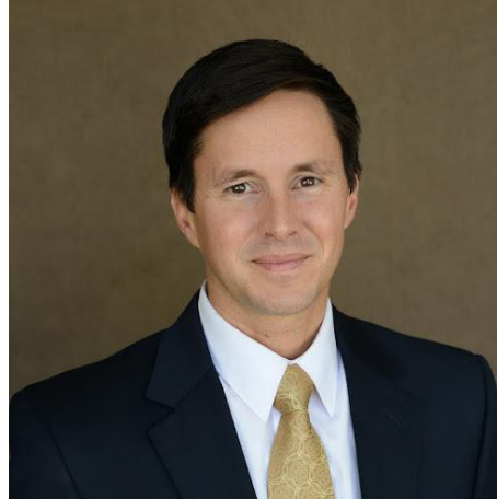
Senator Kirk Cullimore